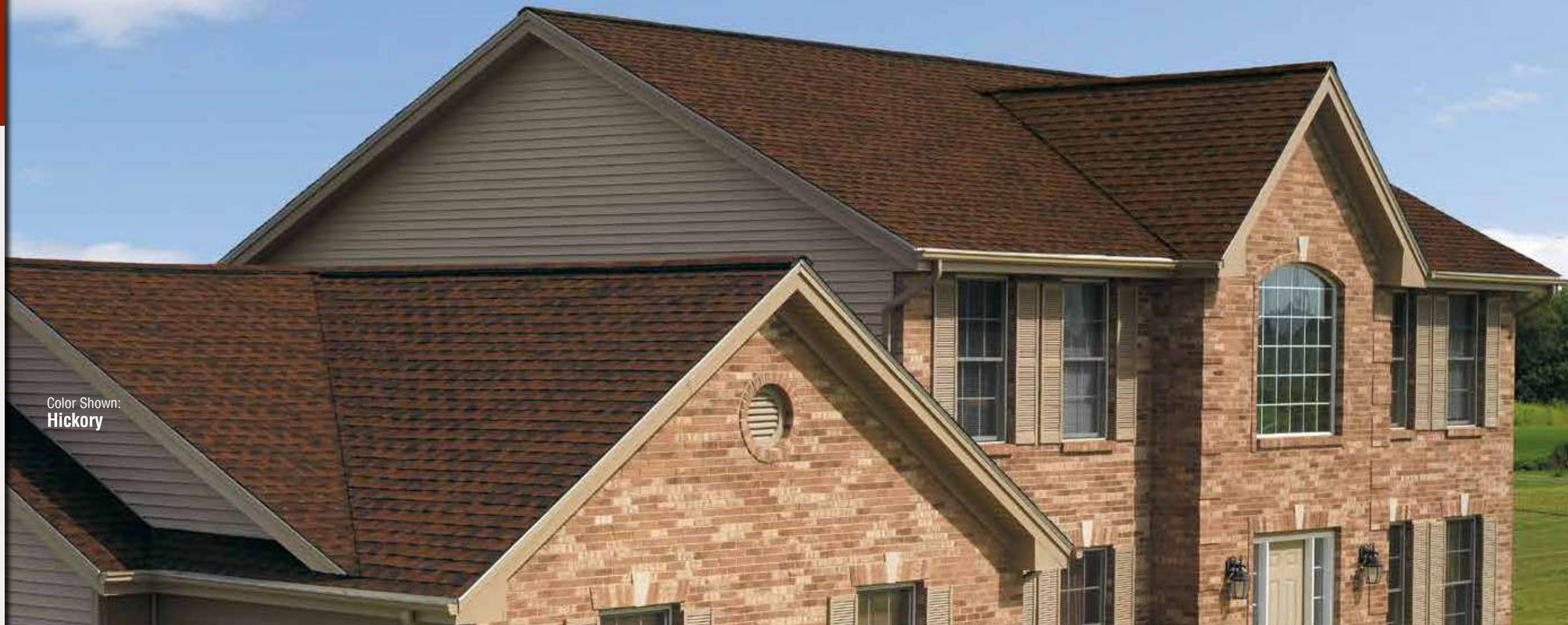
Color Shown: Hickory

Note: It is difficult to reproduce the color clarity and actual color blends of these products. Before selecting your color, please ask to see several full-size shingles.