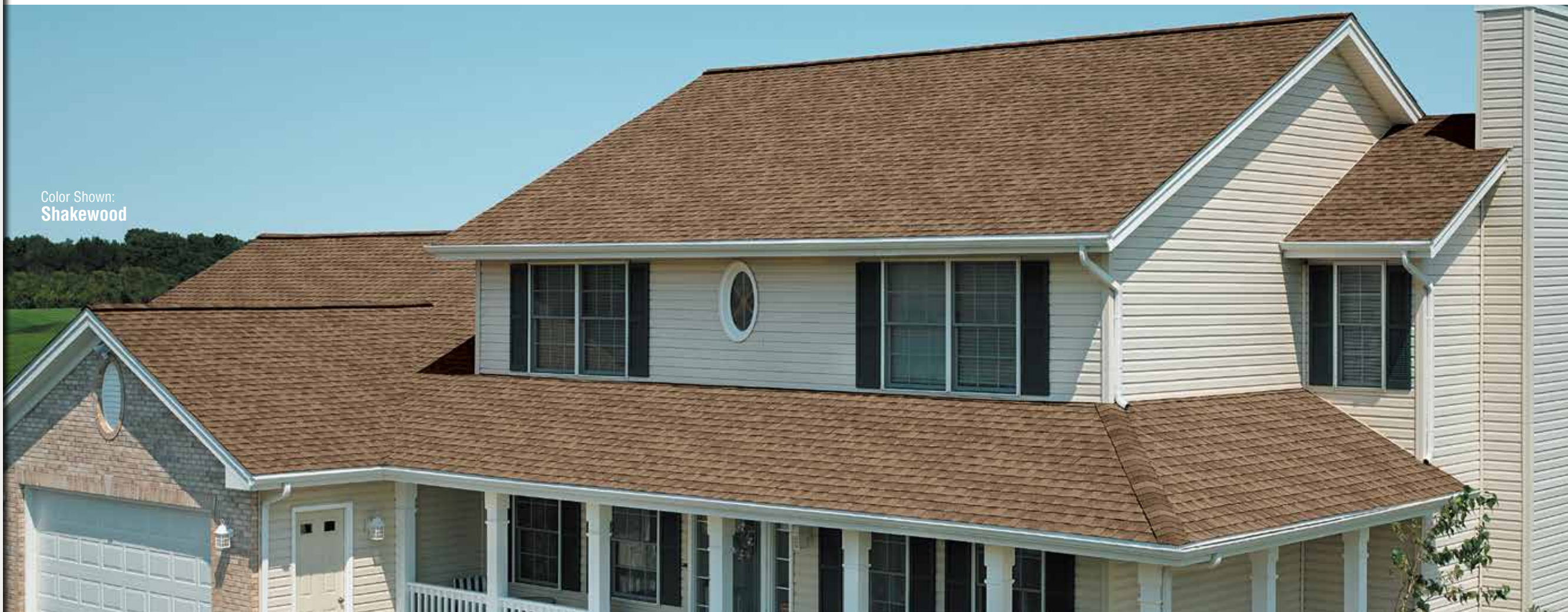
Color Shown: Shakewood