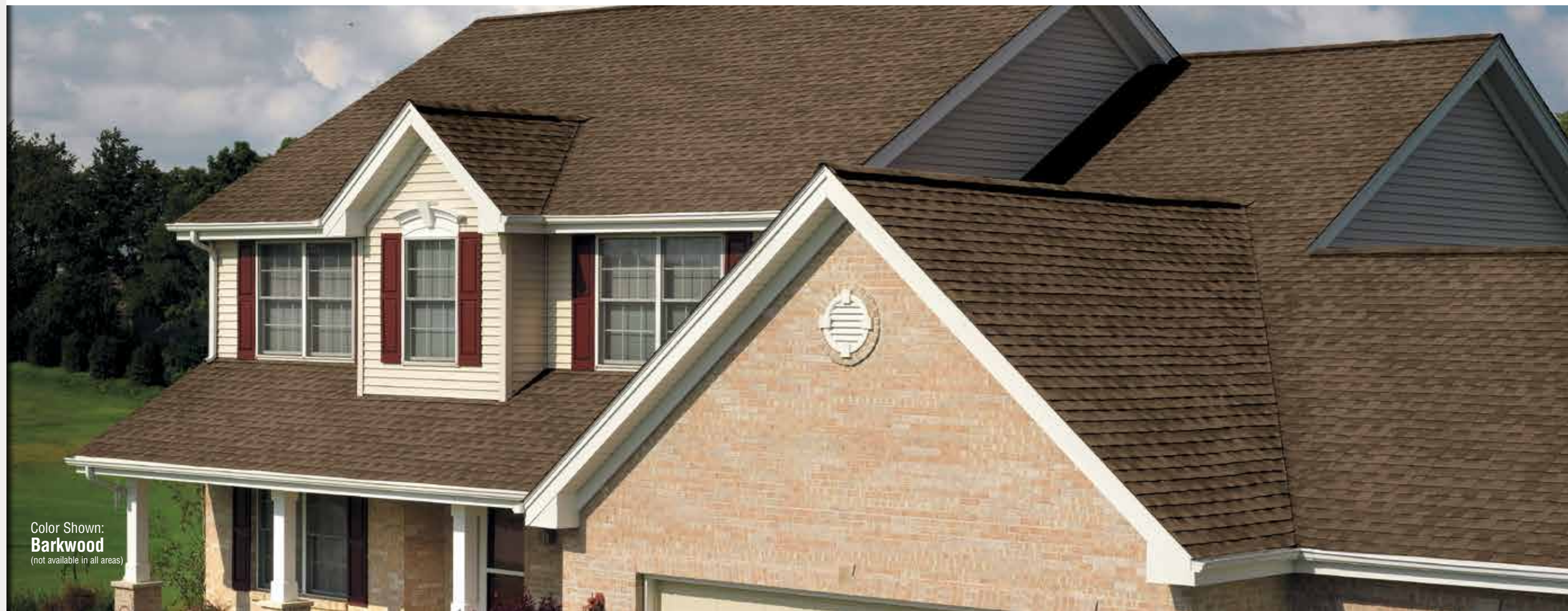
Color Shown: Barkwood (not available in all areas)