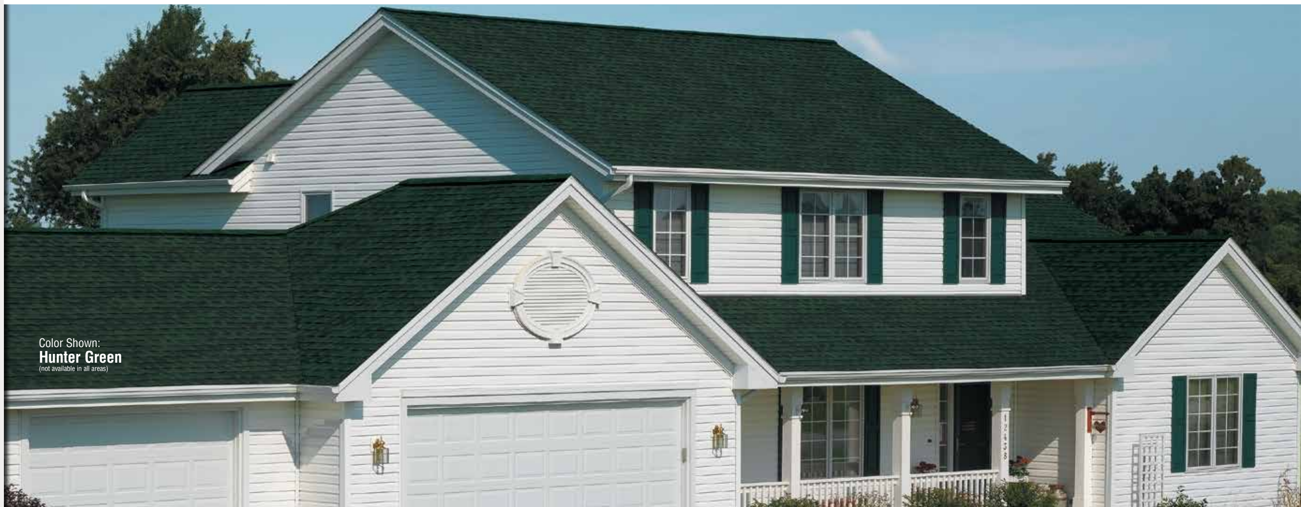
Color Shown: Hunter Green (not available in all areas)