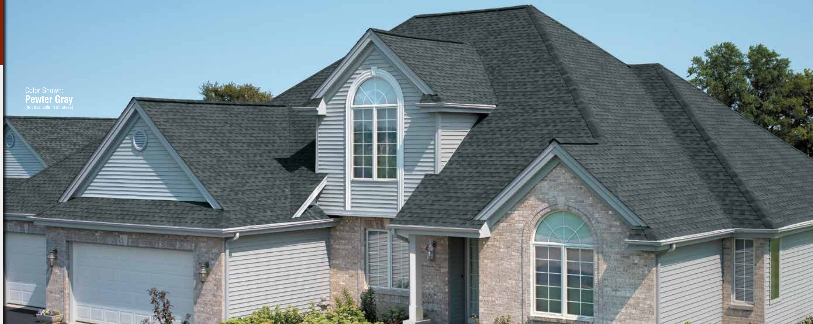
Color Shown: Pewter Gray (not available in all areas)

Note: It is difficult to reproduce the color clarity and actual color blends of these products. Before selecting your color, please ask to see several full-size shingles.