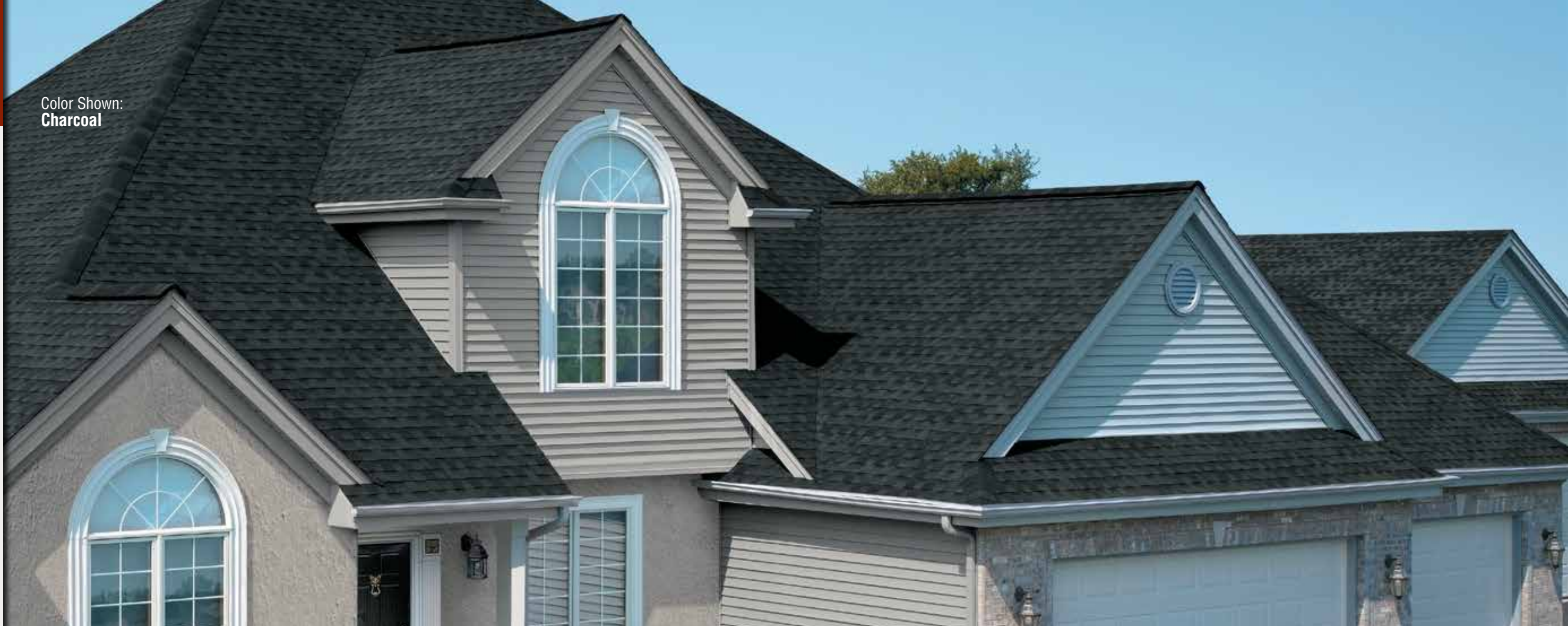
Color Shown: Charcoal

Note: It is difficult to reproduce the color clarity and actual color blends of these products. Before selecting your color, please ask to see several full-size shingles.