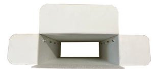
100x100mm, (Facer not included)